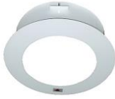
RECESS FRAME TYPE